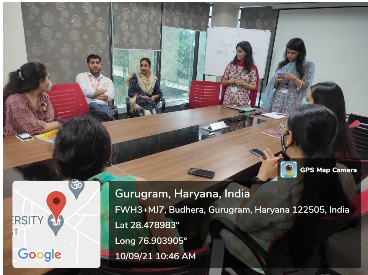
Figure 3: Students and Faculty members during Mental Health Quiz. :

Budhera, Gurugram-Badli Road, Gurugram (Haryana) – 122505 Ph. : 0124-2278183, 2278184, 2278185