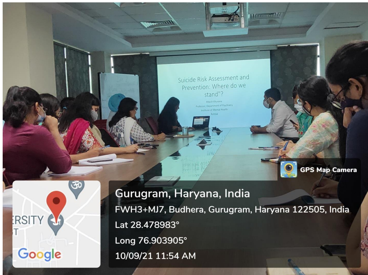
Figure 4: Webinar on “Suicide Risk Assessment and Prevention: Where do we stand?”

Budhera, Gurugram-Badli Road, Gurugram (Haryana) – 122505 Ph. : 0124-2278183, 2278184, 2278185